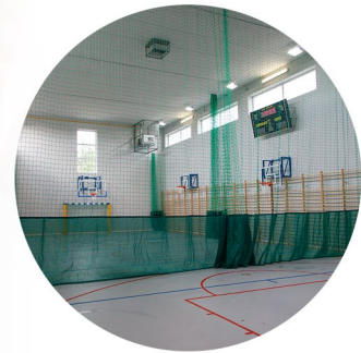
Curtain during folding/unfolding.